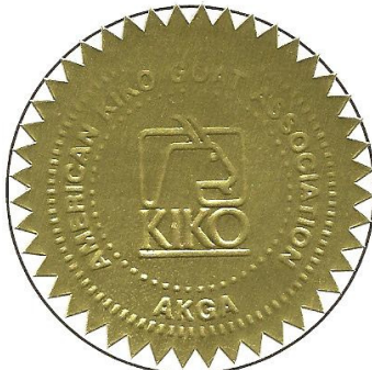
Registered Seal American Kiko Goat Association